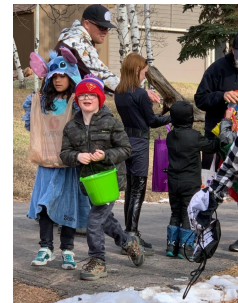
Photos from 2022 Halloween Hayride