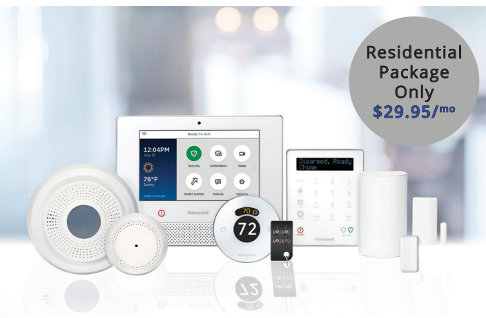
South Park Telephone Now Offers Whole-Home Security Solutions with Connect Secure!

Call Today and Ask us About a FREE Connect Secure System!